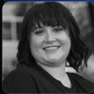
Director Costume Designer