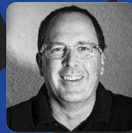
Assistant Production Manager