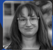
Props Manager/ Social Media/ Marketing