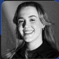
Hair & Makeup Designer/ Assistant Director