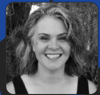
Deputy Stage Manager